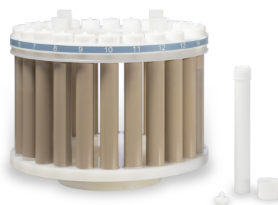
Figure 2 – MAXI-24 HP Rotor

The ETHOS UP used in this study was equipped with a MAXI-24 HP rotor and Milestone's easyTEMP contactless temperature control. The superior temperature capabilities of easyTEMP allow for the processing of different samples of similar reactivities, thus reducing labor time and increasing overall throughput.