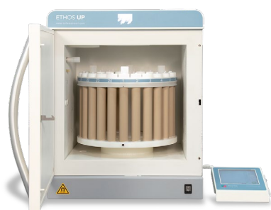
Figure 1 – Milestone's ETHOS UP